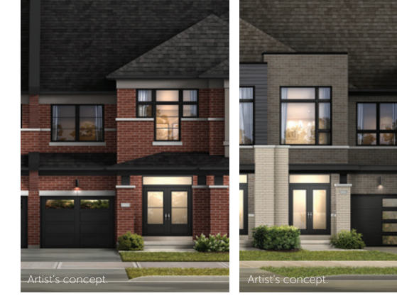
Elevation C Rev